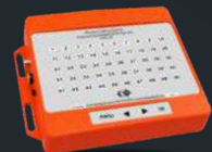
Elevator Calling System*

*DEVELOPED FOR CONSTRUCTION & INDUSTRIAL SECTOR