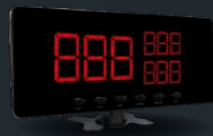
Queue Management Systems